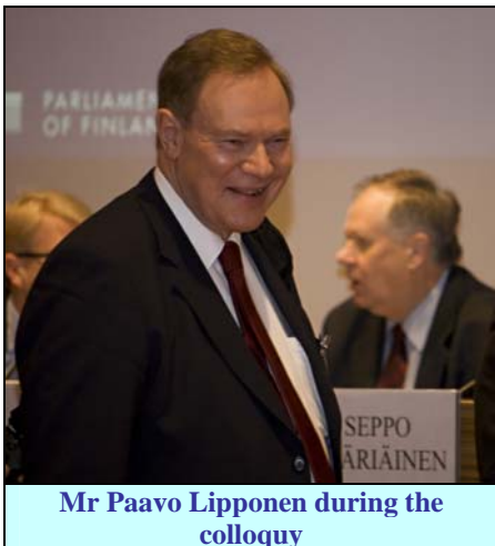
Mr Paavo Lipponen during the colloquy

Mr Paavo LIPPONEN , former Prime Minister and former Speaker of the Finnish Parliament, said that Finland was proud of its foreign and defence policy since the second world war, which had been a policy of survival. Finland was well placed to play a constructive role in enhancing the EU’s cooperation with Russia. Finland had joined the EU under the assumption that all its members worked together on an equal footing and were willing to strengthen the ESDP by actively taking part in conflict-management operations. It was important to make the European Union stronger: it needed to make clear choices and to adopt inclusive policies (energy solidarity, climate change, foreign policy, human rights, partnership with Russia). Russia was a strategic partner for Europe and the EU’s cooperation with it should also be geared to the long-term challenges.