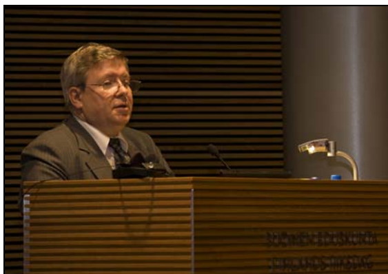
Mr Alexander Torshin, First Deputy Chairman of the Council of the Federation, during his address

Mr Alexander TORSHIN , First Deputy Chairman of the Council of the Federation and Head of the Russian Delegation to the Assembly, presented the Russian perspective on President Medvedev's proposal for a new European security architecture. The multilateral dialogue launched in particular at the OSCE meetings in Vienna and Corfu the previous June and at the last NATO-Russia Council meeting demonstrated the European leaders' serious interest in this issue.