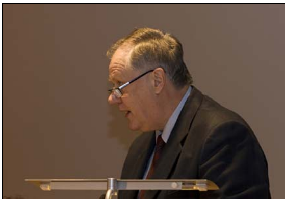
Seppo Kääriäinen, First Deputy Speaker of the Eduskunta, opening the colloquy

The participants were welcomed by Mr Seppo KÄÄRIÄINEN , First Deputy Speaker of the Eduskunta, who remarked on the timeliness of the debate on a new security concept for Europe, as Finland had recently evaluated its own security and defence policy and the Finnish Parliament had approved a White Paper on security and defence. He explained that Finnish security policy was based on the principle of defending the country as a whole and that general conscription would be maintained. Finland played an active part in the ESDP and wanted to continue to be a dynamic security actor within the EU. The triangular EU-NATO-Russia relationship was