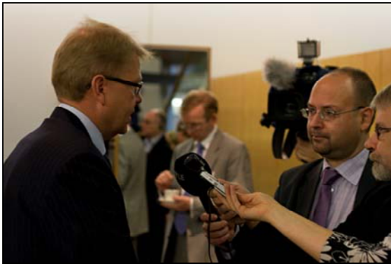
Minister of Defence Jyri Häkämies giving an interview after addressing the colloquy

Mr Jyri HÄKÄMIES , Finnish Minister of Defence, highlighted four main issues: the financial crisis – currently the main global challenge, the issue of energy security, the importance of the High North for Europe and current Finnish security policy. Finland’s position had not changed: it was still not part of any military alliance, although it cooperated with NATO and was active within the framework of ESDP. The Minister also responded to questions from members of the Assembly on various topics such as the North Stream gas pipeline, Finland’s NATO membership and Finnish public opinion.